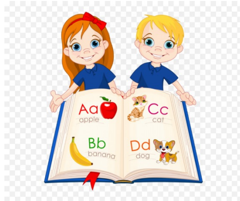
English (n) Tiếng Anh