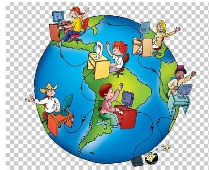
ICT (n) = Information and Communication Technology Công nghệ thông tin