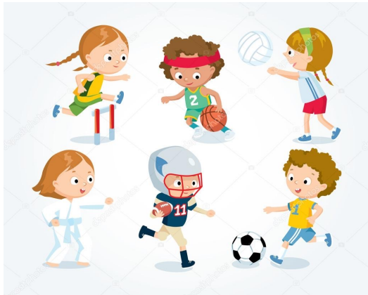
PE (n) = Physical Education Thể dục