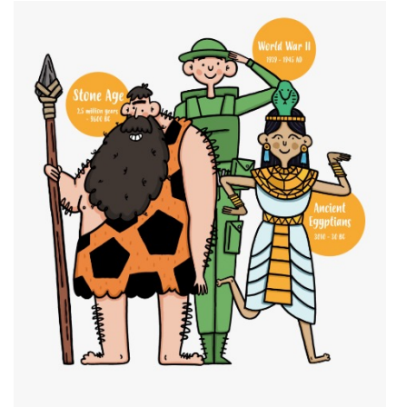
history (n) Lịch sử