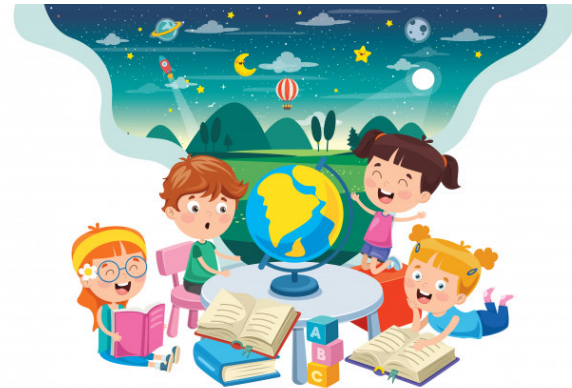
geography (n) Địa lý