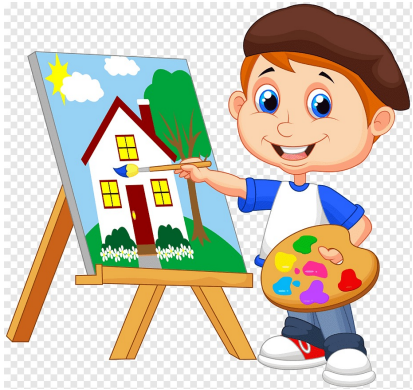
art (n) mỹ thuật