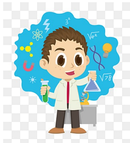
science (n) Khoa học